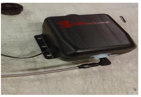
Step 2: After allowing the thread sealant to dry, fill reservoir with water and check for leaks around tank fitting and level sensor. If leak occurs use E6000® sealant.

Step 3: Install the 3qt. tank with four (4) #8x1&1/2" self-tapping screws and four (4) #8 washers (supplied) in desired mounting location. Typical placement is any void area inside the engine bay.