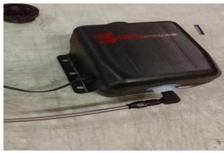
Step 2: After allowing the thread sealant to dry, fill reservoir with water and check for leaks around tank fitting and level sensor. If leak occurs use E6000® sealant.

Step 3: Install the 3qt. tank with four (4) #8x1&1/2" self-tapping screws and four (4) #8 washers (supplied) in desired mounting location. Typical placement is any void area inside the engine bay.